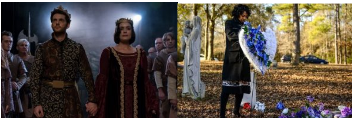
GHOST LIGHT , ALWAYS IN SEASON