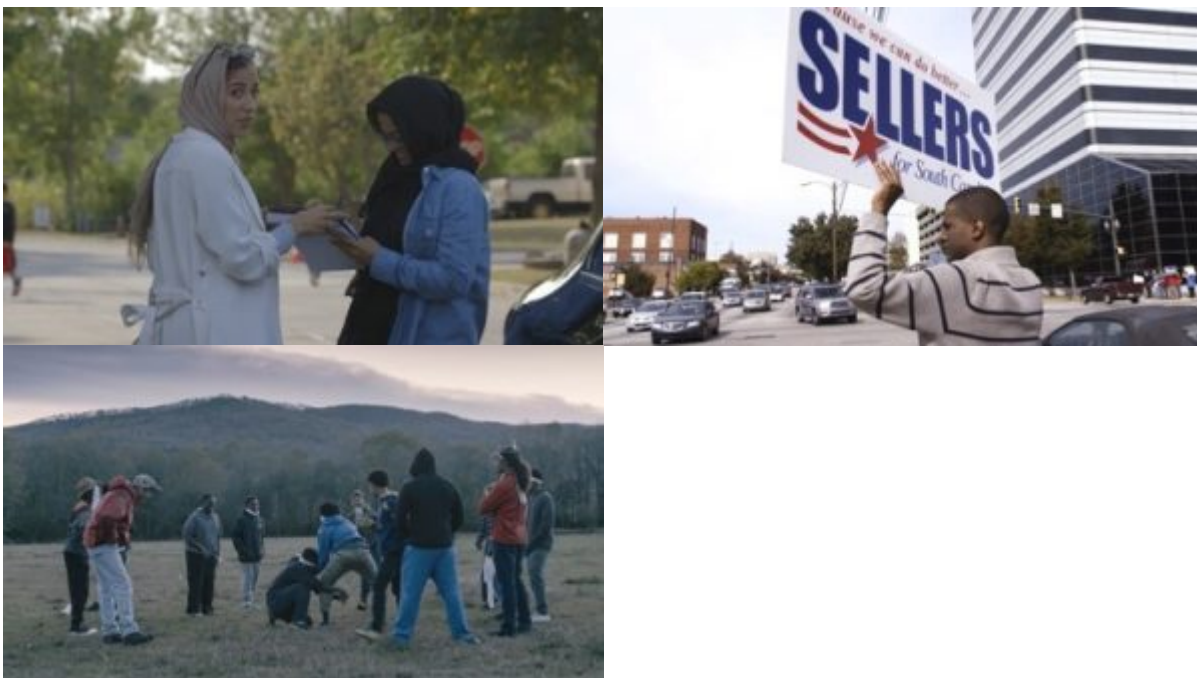
THE FEELING OF BEING WATCHED, WHILE I BREATHE I HOPE, WRESTLE